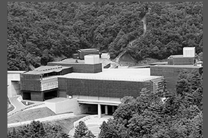
Gifu Museum of Modern Ceramic Art

exhibition, helping to raise the profile of both the Museum Service and of Stoke-on-Trent overseas.